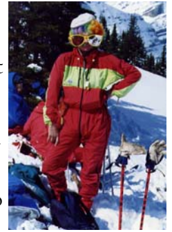
The author on a good day

key for tonight's sumptuous Xmas celebration dinner at the hostel, twice. Even after sneezy had reminded him. So Forgetful had the privilege of driving back to the Hostel while the rest of us raced ahead to try and get to the Hut early and get the pick of the choice sleeping platforms. Unfortunately Forgetful was able to make it to the Hostel on 2 wheels, pick up the door stop turkey and race up the trail quick enough to catch us before the first avalanche slope. Man he's fast, but then we had to break trail all the way too! Snow conditions are excellent with roughly 3 feet of snow and no apparent buried layers and a nice fluffy top layer. The route down to the Hut from Healy pass was by memory so we only had to do a couple extra miles following Don thru the trees before we stumbled onto the trail. Arriving at the Hut we were pleasantly surprised to find a nice pile of chopped wood and kin-