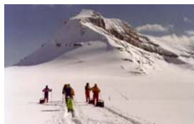
Mt. Daly on the Wapta Traverse

Just then we heard the tiny pawing of hooves on the roof thru the 3 feet of snow and down the chimney came OLD St Nick. At least he hadn't forgotten the Red hat, wig and beard Ah yes the annual gift exchange was about to begin. Gifts varied from a real nice Farside calendar (I know they are all repeats, but who can remember anything that dumb) to a beginners pervert kit complete with the pant legs, instructions for wearing, and string to keep them in place (trench coat not supplied). Oh I forgot to mention there was a couple of guests arrived and as is